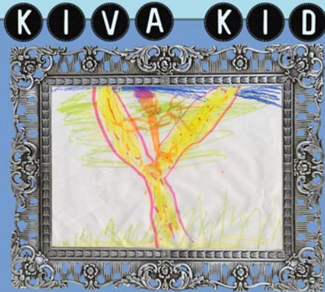
"Me In A Tree"

Name: Parker Age: 6 Member Since: 2007 Favorite Outdoor Activity: riding bikes Favorite Trail Snack: "trail mix, oranges, the jerk" (beef jerky) Strangest Thing Seen In Nature: "a black acorn" Favorite Book: "Spongebob Squarepants" Why KIVA?: "cause I like running through the woods like a cheetah"